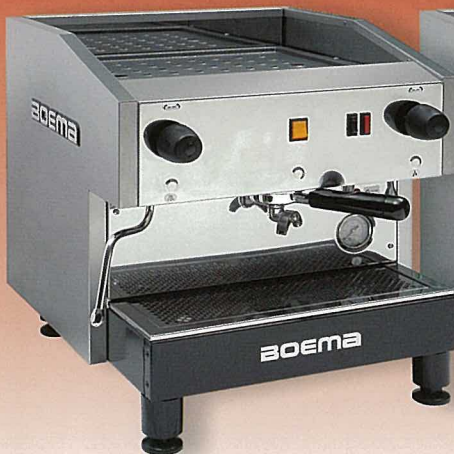
Boema Caffè 1 group - CC-IS10A

Contact BOEMA on 02 9756 4744 for a demonstration or visit our website www.boema.com.au for more information.