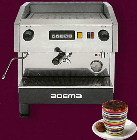
Boema Caffè 1 group - CC-IV10A