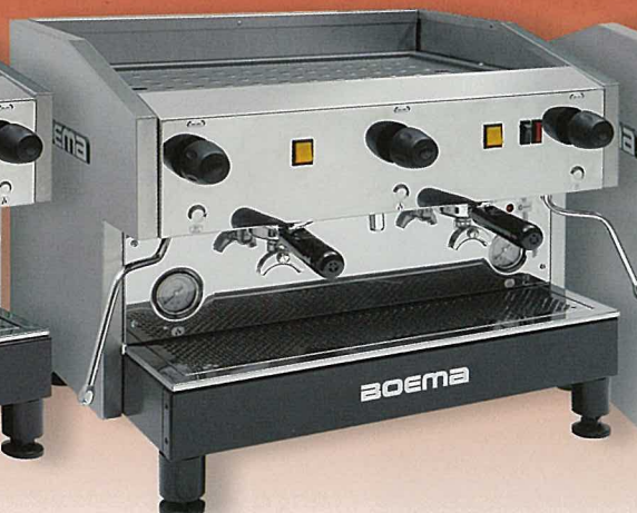
Boema Caffè 2 group - CC-2S15A