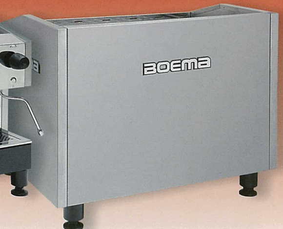
Boema Caffè 2 group back- CC-2S15A